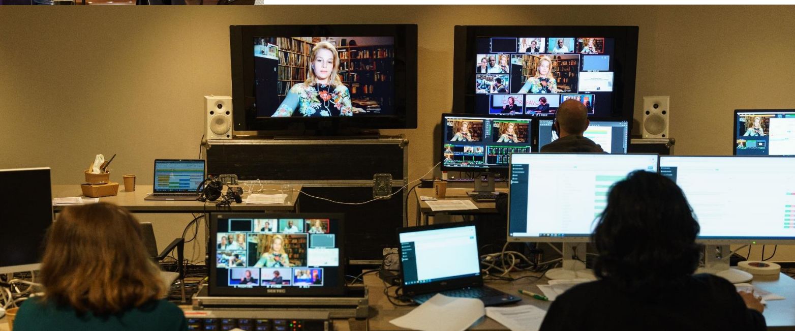
Media & visibility — see annexed visibility report for more details